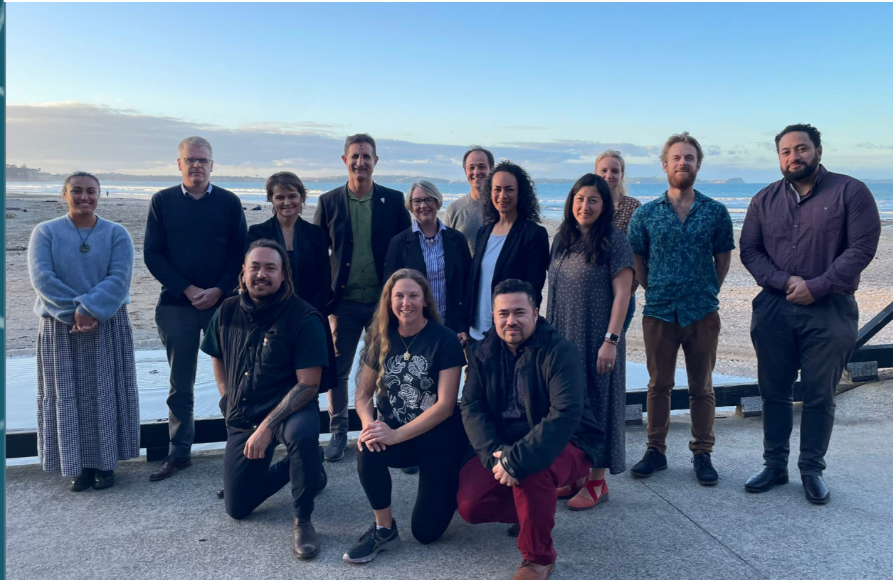
The Aotearoa New Zealand Decade Committee at the Sir Blake Marine & Recreation Centre (MERC), Auckland, World Ocean Day, June 2023

We have youth and wisdom, with multidisciplinary membership that includes scientists, indigenous knowledge holders, government interests, NGOs and early career professionals.