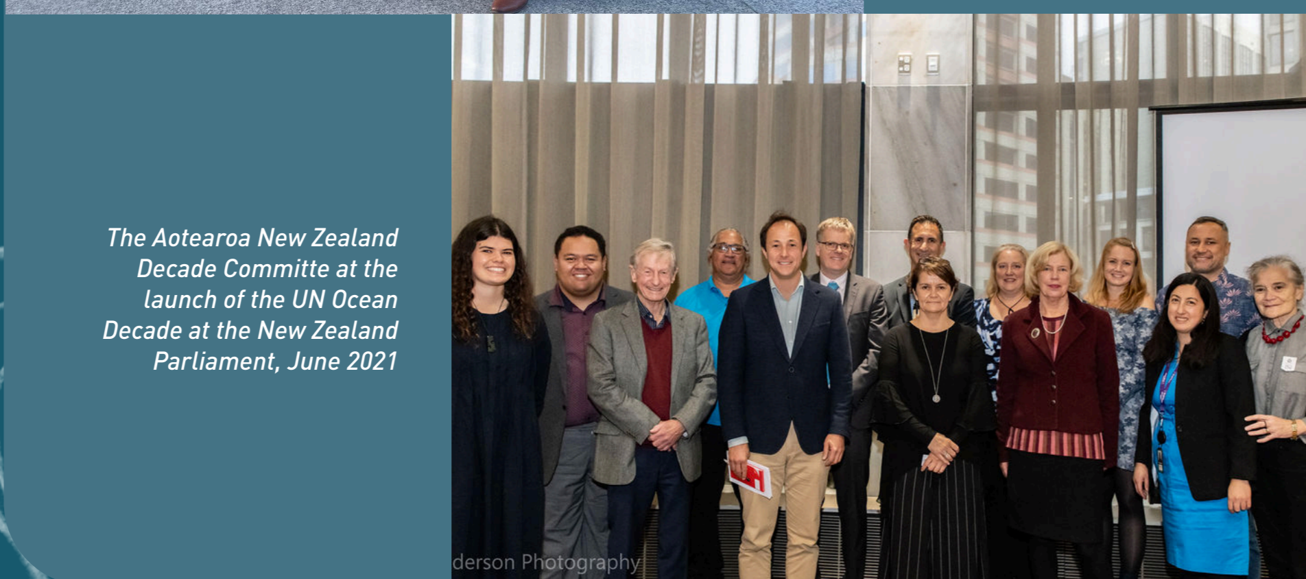
The Aotearoa New Zealand Decade Committee at the launch of the UN Ocean Decade at the New Zealand Parliament, June 2021